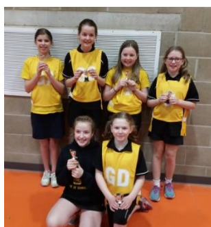
Winners – Jetts Crystals