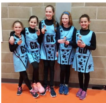
Winners: Rockets Missiles