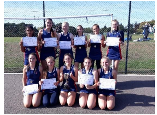
(U16 winner – Berkhamstead)

The level of Netball was incredible and it was great to see so many schools and players take part. Congratulations to the winners and runners up and well done to all who participated.