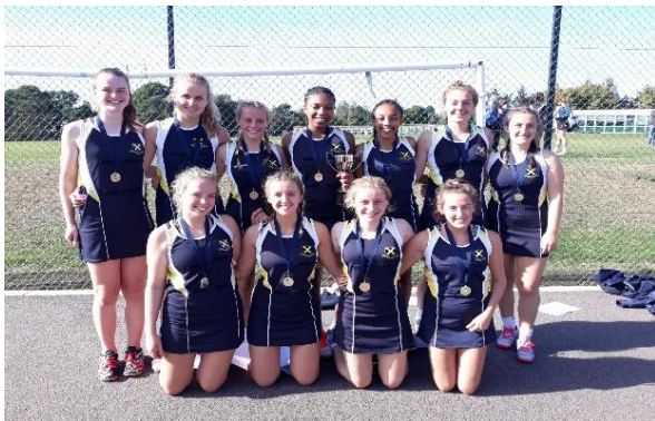
(U19 winner - St Albans High School For Girls).

The day also saw the U19 tournament with St Albans High School for Girls and Beaumont battling in it out for the top spot. After a great day of some fast paced Netball. U19 winners were St Albans High School For Girls and runners up, Berkhamsted.